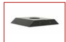
Accessory Cover for MOD-CPF Ceiling Plate